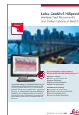
Leica GeoMoS HiSpeed