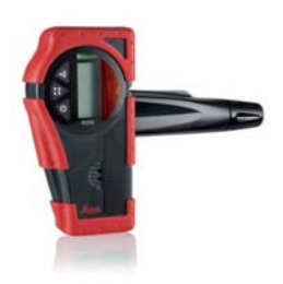
R250 laser detector with clamp for Roteo 20HV/25H/35 Art. No. 772793 For locating the red reference laser beam