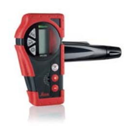
RRC350 combined remote control/detector with clamp for Roteo 20HV/25H/35 Art. No. 762771 For locating the red reference laser beam