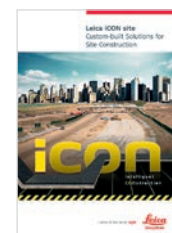
Leica iCON site Brochure