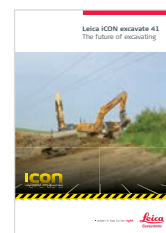
Leica iCON excavate 41 Brochure