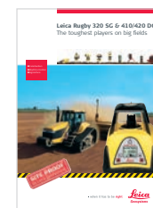
Leica Rugby 320 SG & 410/420 DG Brochure