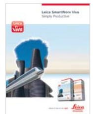
Leica SmartWorx Viva Product brochure