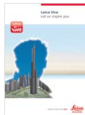
Leica Viva Overview brochure

Illustrations, descriptions and technical data are not binding. All rights reserved. Printed in Switzerland – Copyright Leica Geosystems AG, Heerbrugg, Switzerland, 2009. 774267en – VI.09 – RDV