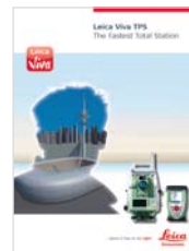
Leica Viva TPS Product brochure