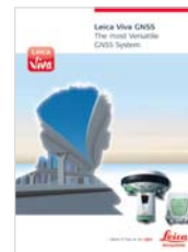
Leica Viva GNSS Product brochure